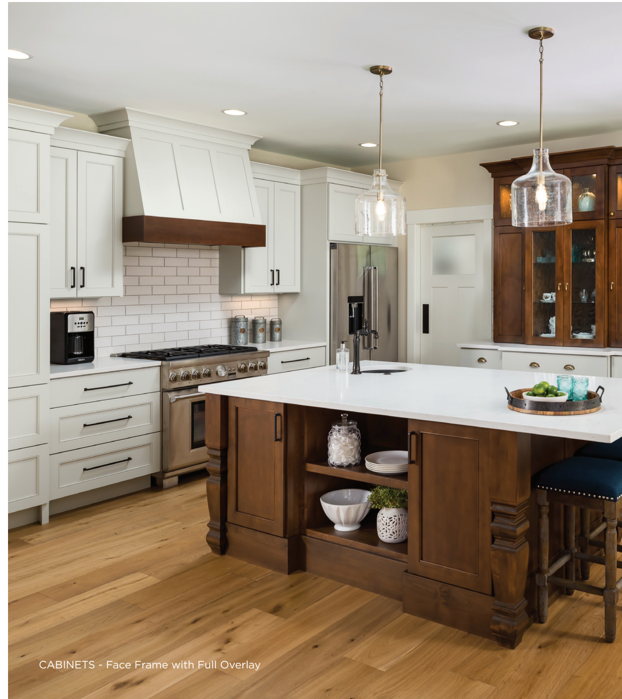
CABINETS - Face Frame with Full Overlay