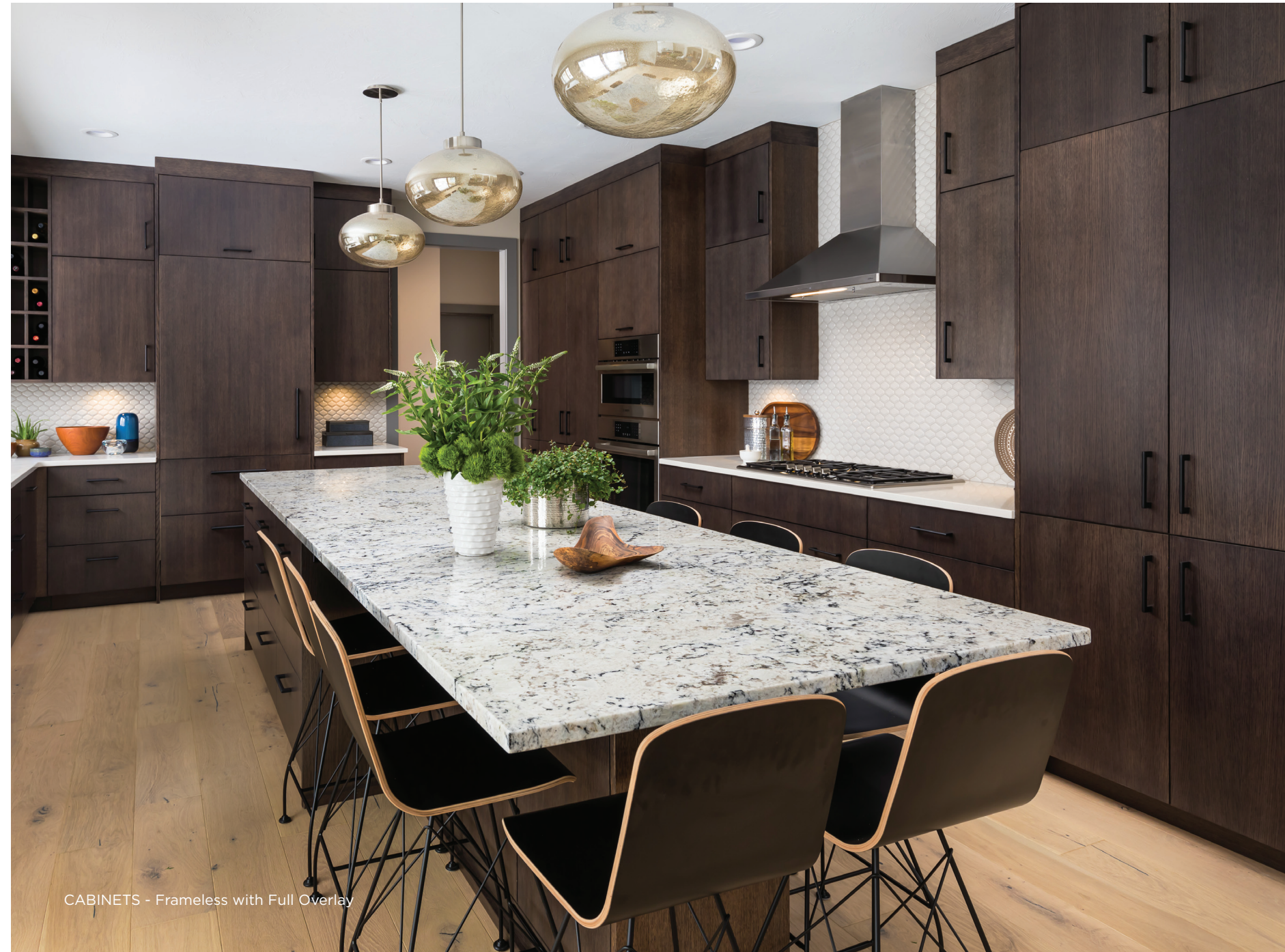
CABINETS - Frameless with Full Overlay