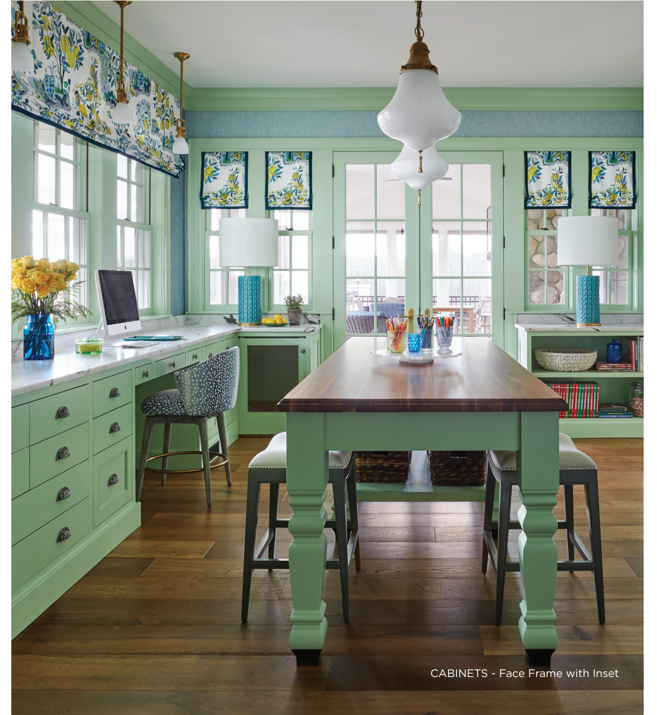
CABINETS - Face Frame with Inset

{LEFT} A well-appointed butler pantry gives the appearance of a galley kitchen, blending form and function, perfecting the space while maximizing functionality. Custom colors and finishes create lasting beauty.