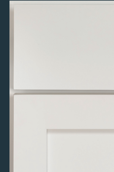
FACE FRAME WITH OVERLAY

Inset cabinetry showcases doors and drawers that fit precisely inside the face frame openings. This type of cabinet construction gives a full view of the cabinet frame. Clean lines, flush doors, and the options of exposed or concealed hinges are features of inset cabinetry.