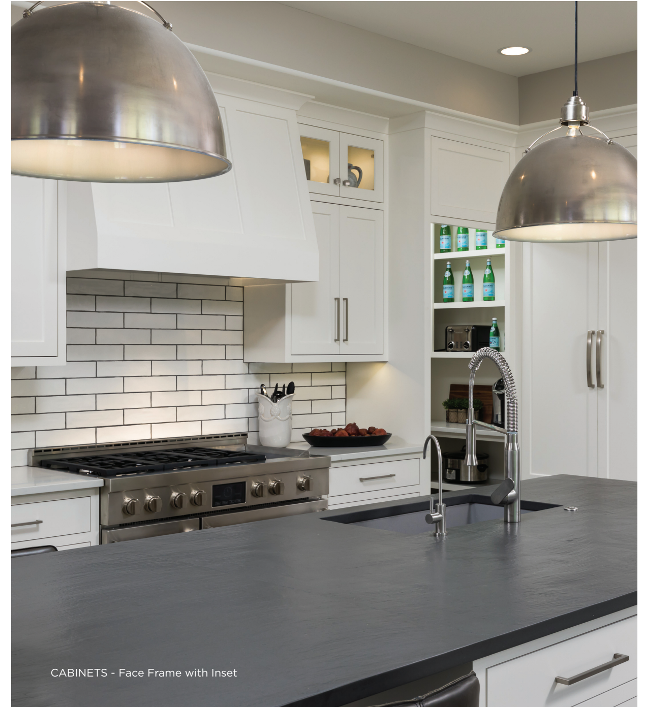
CABINETS - Face Frame with Inset